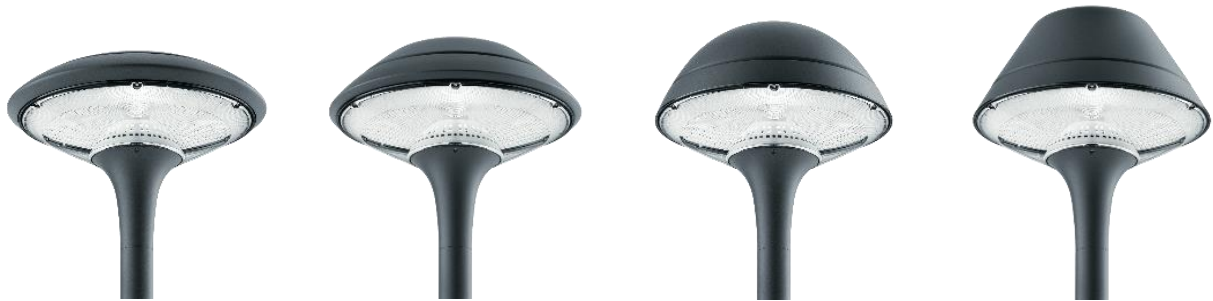
Plurio LED is available in different design variants