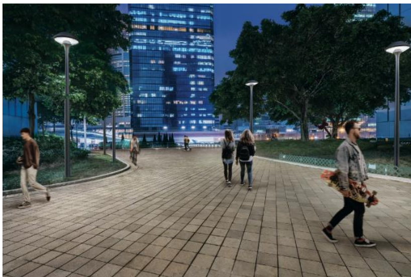
Plurio LED Indirect can be equipped with Thorn's innovative new NightTune technology, to adjust the lighting level and colour temperature to match the time of night and level of traffic